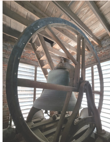
Bell with Fly wheel

The following photo is of the original bell installed following the 1887 fire that destroyed the original building on site. The rebuilt church (now standing) was dedicated in 1889.