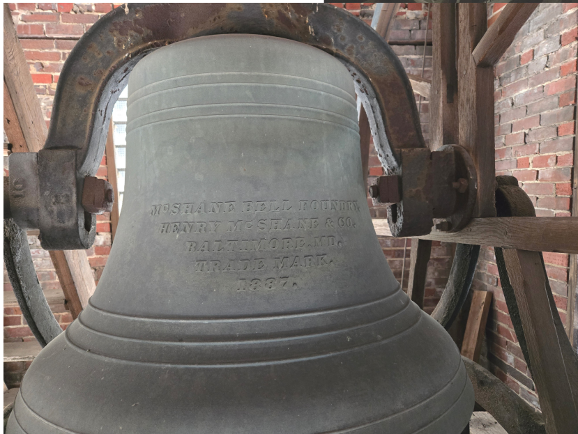
Inscription: McShane Bell Foundry Henry McShane & Co. Baltimore, MD. Trademark. 1887.